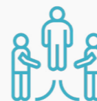
Chart a course through the many areas of detail that often slip companies up pre-construction planning and project initiation